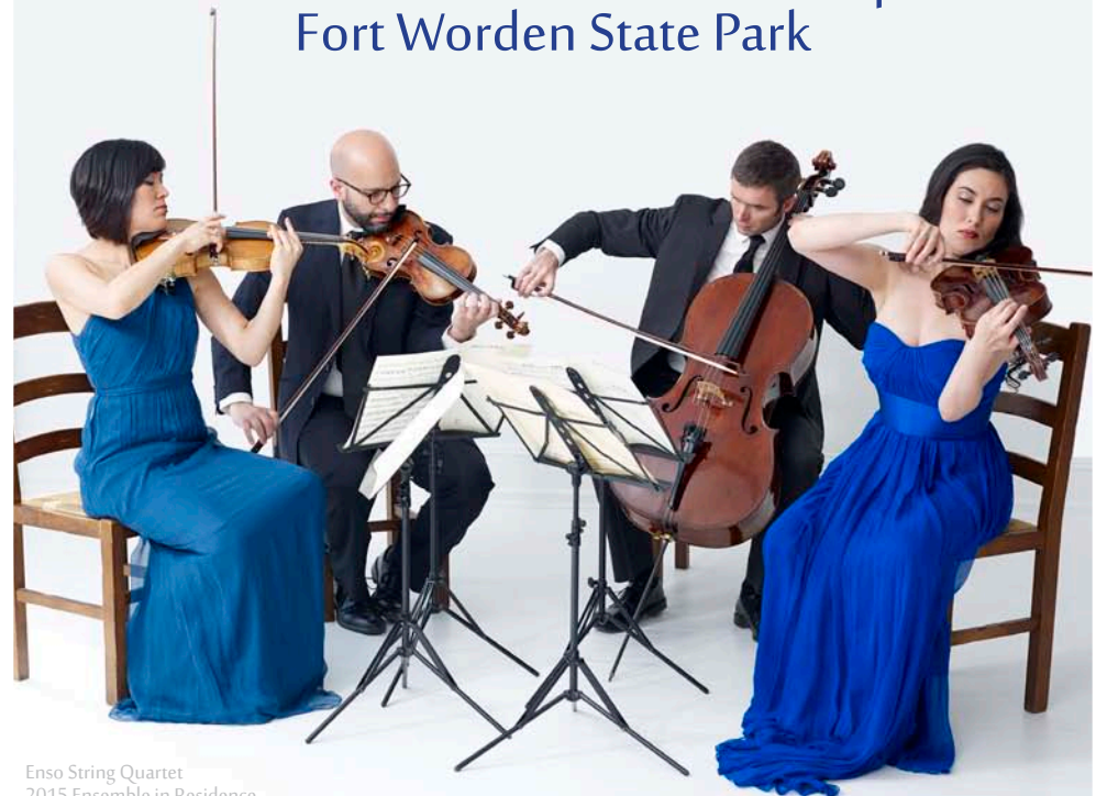
Enso String Quartet 2015 Ensemble in Residence

2014-15 Concerts & Workshop Fort Worden State Park