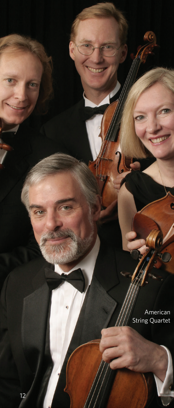
American String Quartet