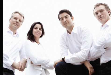
2018 Pacifica Quartet