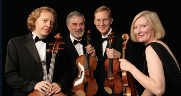
2019 American Quartet