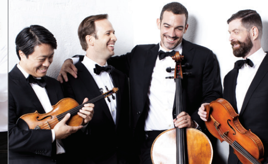
2017 Miró Quartet