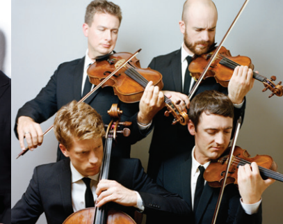
2016 Calder Quartet

Rehearsals and coaching 7:30 pm PUBLIC CONCERT With participant ensembles